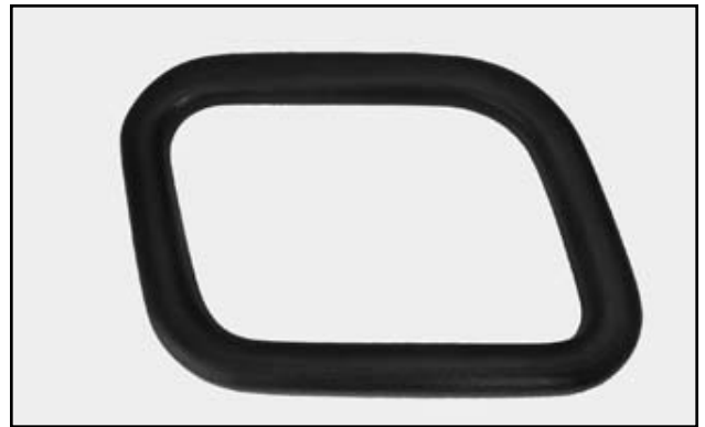
Product No. 30-13