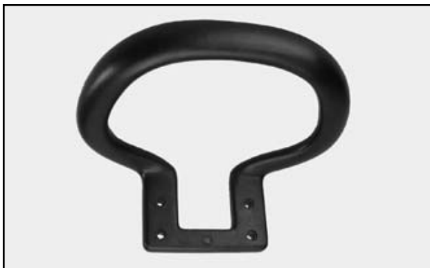
Product No. 30-150