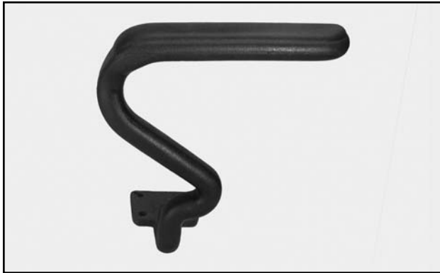
Product No. 30-10