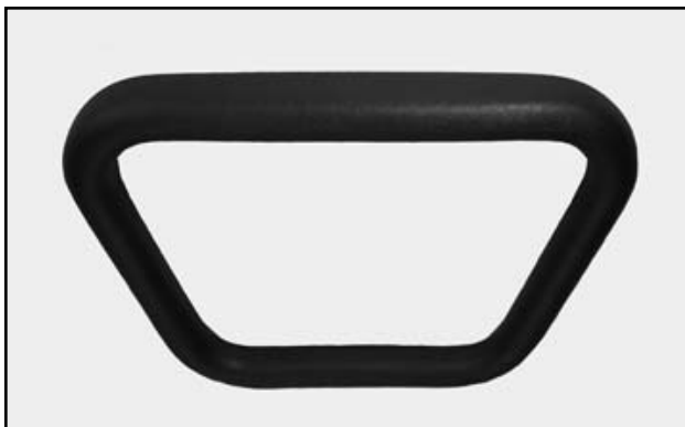
Product No. 30-21