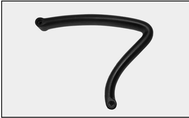
Product No. 30-91