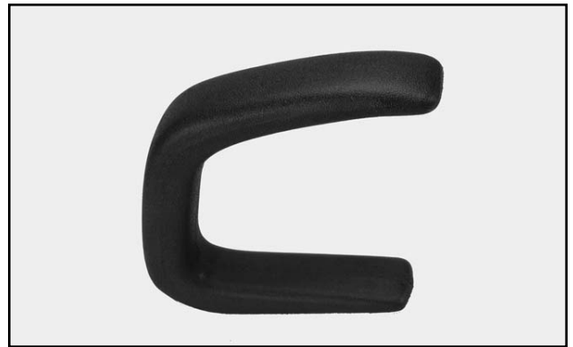
Product No. 30-92