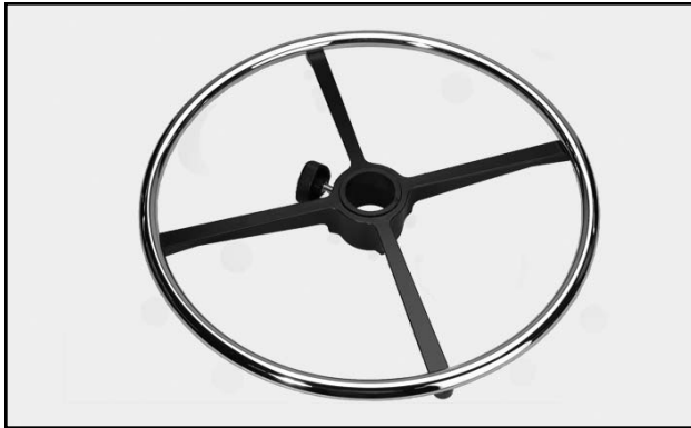
Product No. 33-900-50