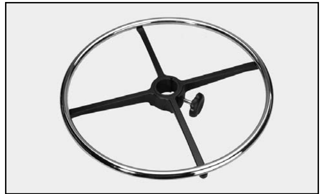
Product No. 33-920-50