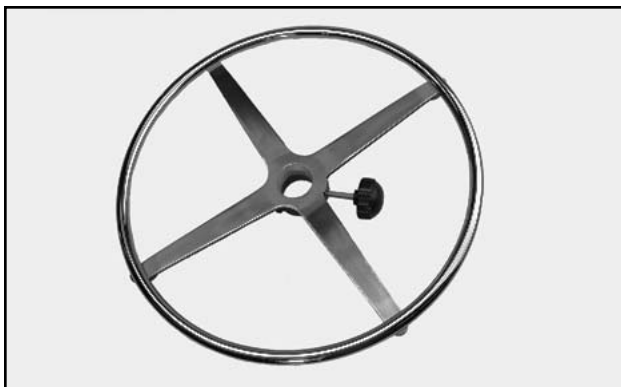
Product No. 33-201-FR-A-PLBK Metal to metal contact between hub and gas cylinder. Can be used for ESD application.