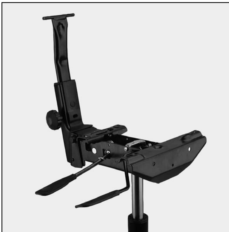
Product No. 15-293LV